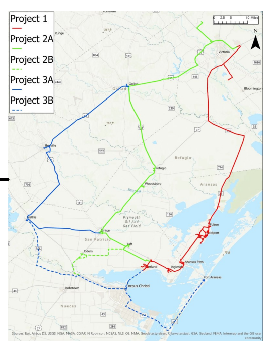
Three proposed routes.

President Biden Proposes $100 Billion for Broadband Infrastructure USA Today April 3,, 2021