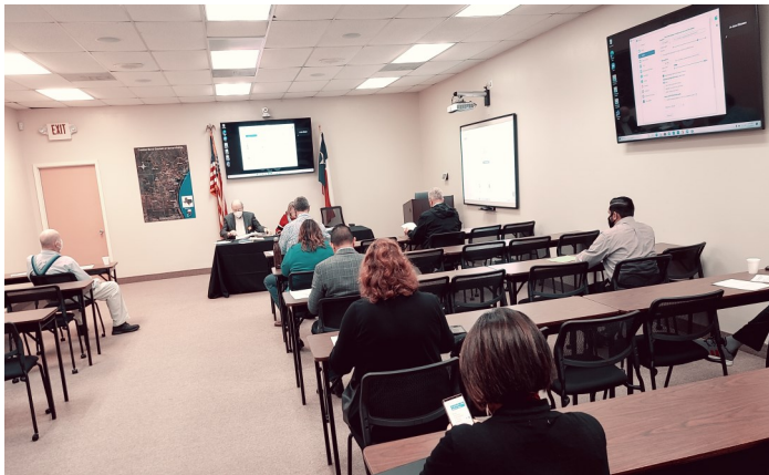
The January 2021 Board of Directors Meeting was held in the upgraded space. Members attended in person and virtually via ZOOM.